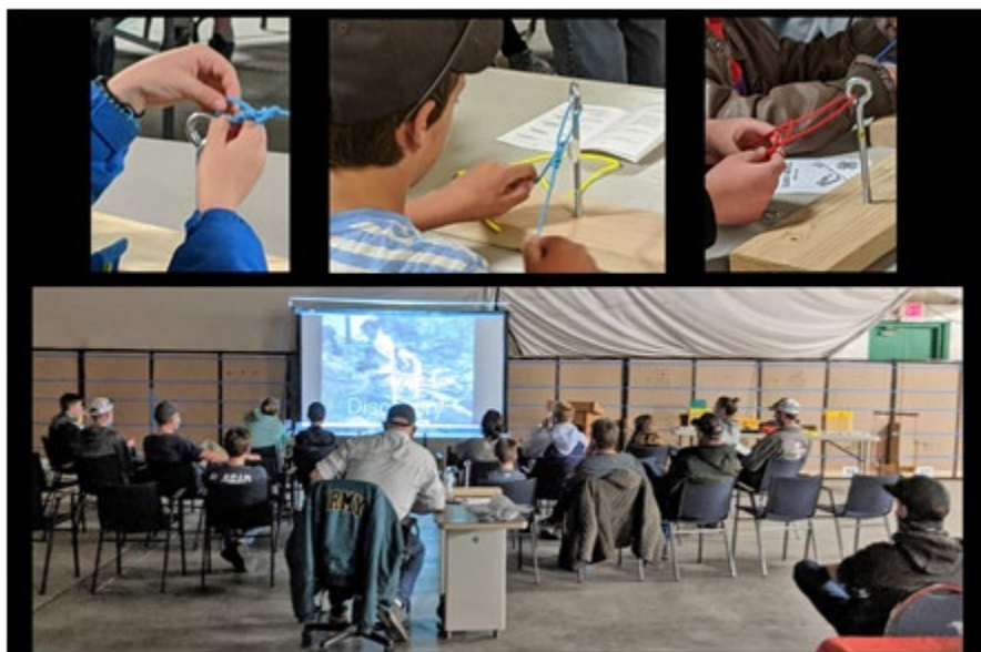
Sport Fishing workshops in April 2021.

4-H SPORT FISHING season 2021 is underway. Weekly Tuesday workshops will continue throughout May and into August. We will meet each Tuesday evening at 6:00 pm. Please watch for emails and text messages with updated details about meeting locations. Once we move outside for our workshops, weather might impact our schedule and locations. In April we had two Sport Fishing workshops at the 4-H Bill Hamilton Building: Signups plus popcorn and a movie: The Underwater World of Trout / Discovery . If you are interested in seeing this video or watching it again, type into your search browser on your computer: "The Underwater World of Trout Part One - Discovery" and the YouTube video should be accessible to you. There are two companion videos if you are interested; you could access them the same way. They are: "The Underwater World of Trout Part Two - Feeding Lies" and "The Underwater World of Trout Part Three - Trout Vision." Our second workshop had project members learning and practicing Fishing Knots that they will be using when fishing. We plan to begin outdoor fishing in May [dependent on the weather]. Project members will be introduced to stream, river, pond and lake fishing at numerous locations throughout the Helena area.