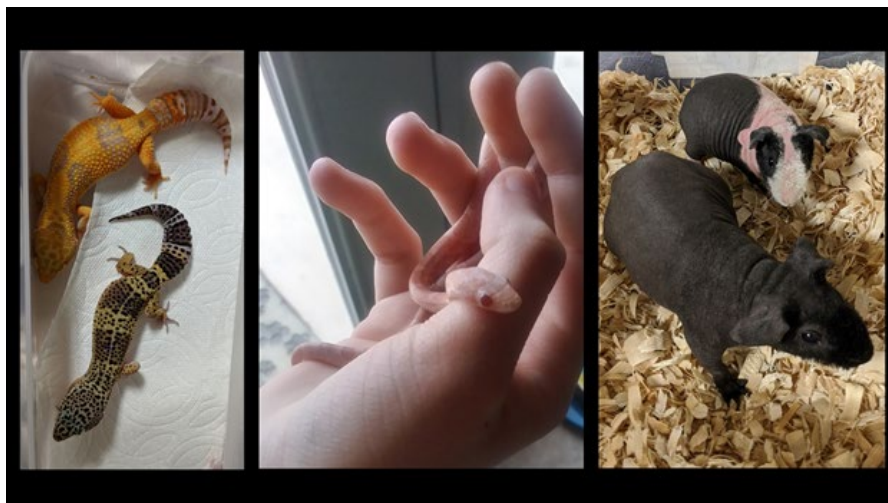
Enjoying Pocket Pets.

Before the workshop ended, project members were given a few moments to write down information about this workshop in their draft project Record Book pages. We also had a short review about what the Record Book pages actually look like and how to complete them, along with the “why” of doing 4-H Record Books. Project members were reminded that Record Books must be reviewed for the Fair no later than June 10th. Pocket Pets project members' Record Books can be reviewed at the May 24th workshop, on Wednesday evening, May 26th during an all-project review at the BHB, or on-line / email provided to the project leader. Guidelines and examples will be emailed to each Pocket Pets member in early May. Contact your project leader if you have any questions.