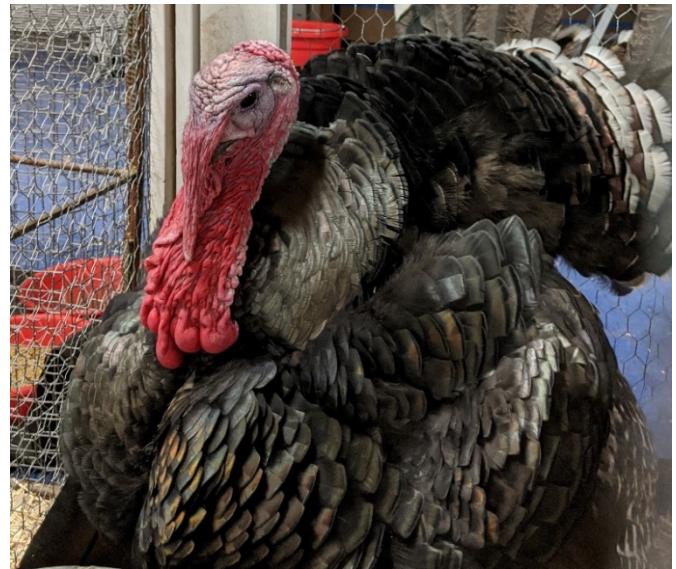
Turkey exhibited by William Bushnell - 2020 Fair.

The Poultry December workshop was in-person on Saturday, December 12th at the BHB. Level one project members did pages 24 & 25 of Poultry Project Book level one (“Scratching the Surface”) that had them working on a section called “Chicken Feed.” This section provides the “Fowl Facts” about Feeding Poultry. Activities were doing a Feed Ingredient Word Find, reviewing poultry feed information on page 25 and also reviewing handouts about poultry feed and nutrition. An overall message from this workshop was that chickens and other poultry need to have a nutritionally balanced diet to develop into - and remain - healthy birds. Chicks require a high protein content. But as the birds get older, they need less protein and more starch.