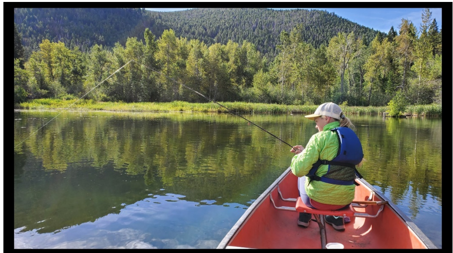
Fishing during an August 2020 4-H Sport Fishing workshop.

Just like in other projects again this 4-H year, project members are expected to do a record book that journals their goals, record of workshops attended, what they did and what they learned at each workshop. At our first workshop project members will be asked to write down at least three goals they have in Sport Fishing for this year. Record books