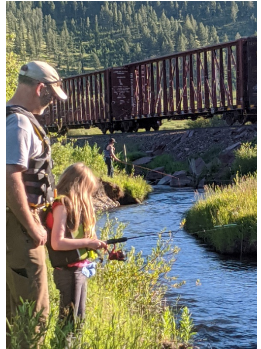
Family and Sport Fishing at Dog Creek on the westside of McDonald Pass in July 2020. Everyone is wearing a life jacket.