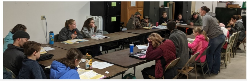
Project members learning Poultry terms and Poultry breeds.

Our March workshop was on Saturday, March 14 th in the BHB. For this meeting - project level one members did pages 22 and 23, "Talk the Talk", of Poultry Project Book level one ("Scratching the Surface"). The exercises on these pages had the project members matching Poultry terms with definitions. Each member had drawn a question out of a bowl and answered it for the group. Available for review at this meeting was a copy of the American Poultry Association's "American Standard of Perfection" Book. This book helps Poultry project members identify poultry and learn more about them.