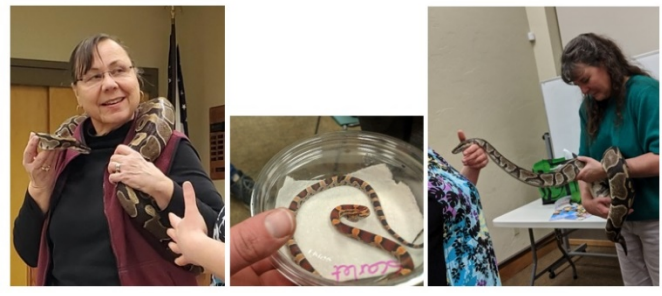
Learning about SNAKES.

While we had to cancel our March workshop, we hope to meet in April on Monday, 27th. Our meetings during the next couple of months will depend on public guidelines and the continued availability of meeting space at Montana Wild. Please watch for emails and text messages with updated details about meetings and about Pocket Pet activities in your project books.