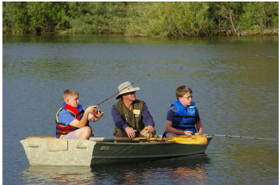
4-H Sport Fishing at Spring Meadow Lake in Helena.

Project workshops will initially be at the 4-H Bill Hamilton Building at the Fairgrounds. We will also meet once at Montana Wild. Then we'll begin outdoor fishing in June (per adjusted schedule), getting an introduction to stream, river, pond and lake fishing at numerous locations throughout the Helena area. Project Requirements: 1) Fishing gear: it's good if the 4-Her has their own fishing gear but please know that we do have fishing equipment available for those who don't have any; 2) project fee is $15.00; 2) a medical